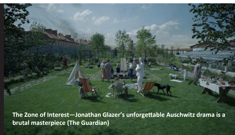
The Zone of Interest—Jonathan Glazer's unforgettable Auschwitz drama is a brutal masterpiece (The Guardian)

Great films on the BIG screen with Stafford Film Theatre at The Gatehouse Sep 2024—Jan 2025