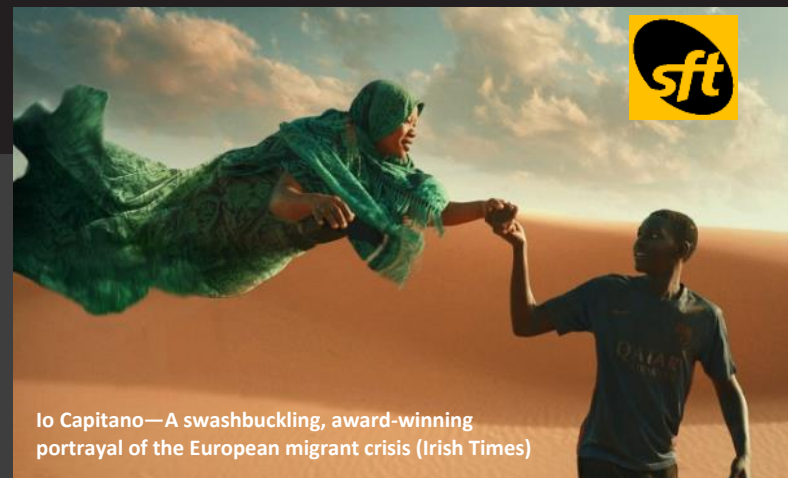
Io Capitano—A swashbuckling, award-winning portrayal of the European migrant crisis (Irish Times)

Great films on the BIG screen with Stafford Film Theatre at The Gatehouse Sep 2024—Jan 2025